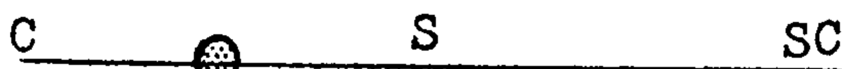
(Fig. 2.) SEND