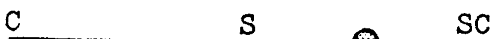
(Fig. 3.) RECEIVE

to illustrate this. The idea is to "slide" the focal point of your mental awareness (mind) between the Conscious and Subconscious areas of awareness, depending on whether you are sending or receiving a message. Fig. 1 shows a thread with a bead on it which can move in either direction from the center. "C" indicates the Conscious mind, "S" denotes the SUBLIMINAL MIND and "SC" refers to the Subconscious.