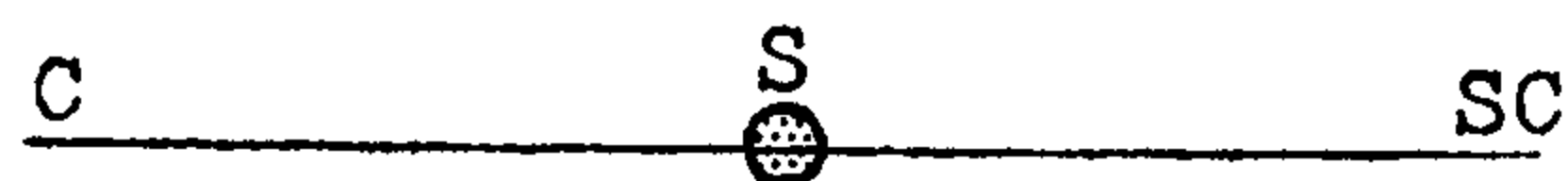
(Fig. 1.) RELAX

Another secret method I use, is something my own Teacher revealed to me and which is known only to advanced beings. It is called the "Awareness Slide". I have drawn three diagrams